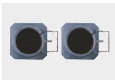
S110A7 Turn tables Diameter 310 mm Capacity 1,000 kg

For wheel alignment operations on trucks and buses, measuring heads RAVTD8060TWSR supplied with the aligner must be used.