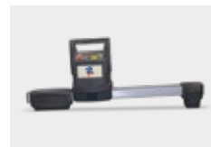
Front measuring heads 18422-18423