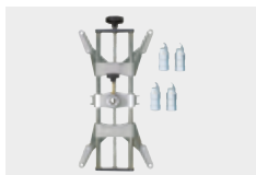
STDA33EU Pair of self-centring 4-point clamps, grabbing, for 10" to 24" rims