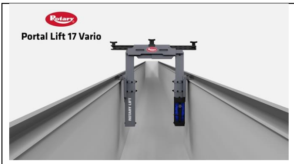
Rotary-Blitz P 17 Vario-Hero-A