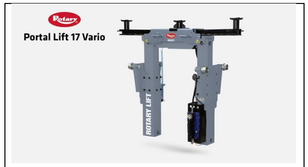
Rotary-Blitz P 17 Vario-Hero-B