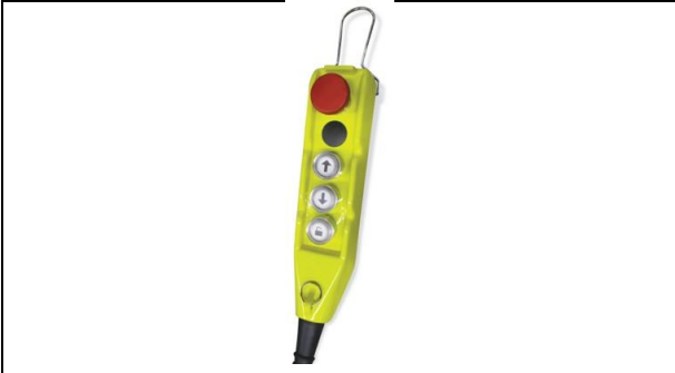
Rotary-Portal Lift 17 Vario-remote-control-MI