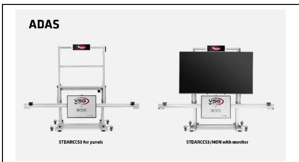
Wheel Alignment - ADAS