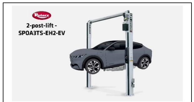
2-Post-Lift - SPOA3TS-EH2-EV