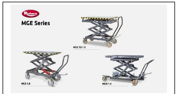
Lifting Tables - Master Gear Series